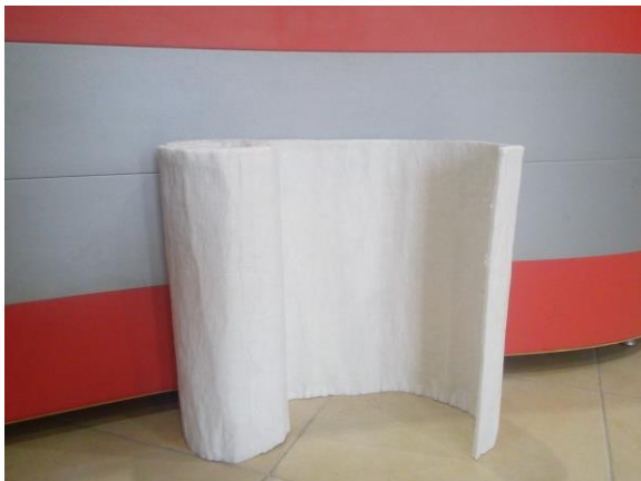
5 – 12 mm flexible blanket

IRogel® is an opacified aerogel blanket for effective blocking of the radiation component of heat transfer. It delivers excellent thermal insulation up to 1200°F (650°C) for applications including aerospace, transportation, industrial equipment, power generation, nuclear power plants, high-temperature thermal and fire protection.