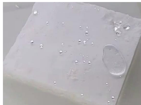
Super Hydrophobic, IRogel Board

Landfill disposable, shot-free, with no respirable fiber content